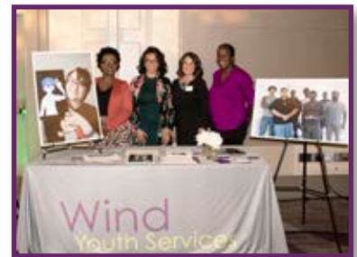
Team members from Wind Youth Services provide information about their work focusing solely on runaway, homeless and street youth, and transition-age youth.