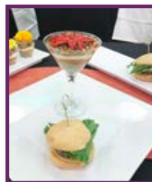
Savory and sweet offerings highlight the Showcase of Farm-to-Fork fare.