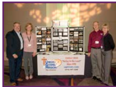
Union Gospel Mission representatives share information about their organization at the Challenge of the Chefs.