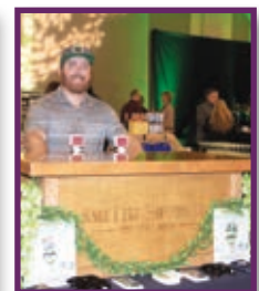
Matchbook Wines and Knee Deep Brewing—two of the vendors pouring tastings.